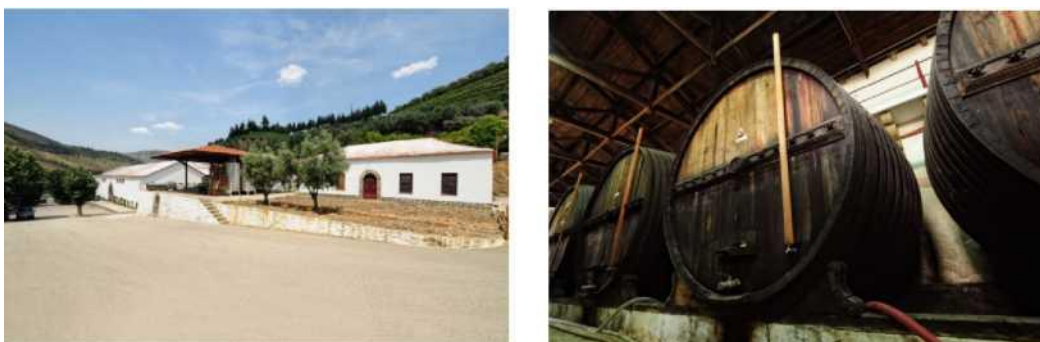
Warehouses and winery of Quinta dos Frades

This property still maintains the characteristic structure of an estate, with a residential area composed of the stately home, caretaker's house, the cottages of the permanent or seasonal workers, the kitchen and refectory; a production area full of vineyards and other crops such as olive and fruit trees; the manufacturing and storage area consisting of olive and wine presses, winery, alembic and warehouses; the sales and administration area with its office; as well as the cultural and welfare area composed of the chapel.