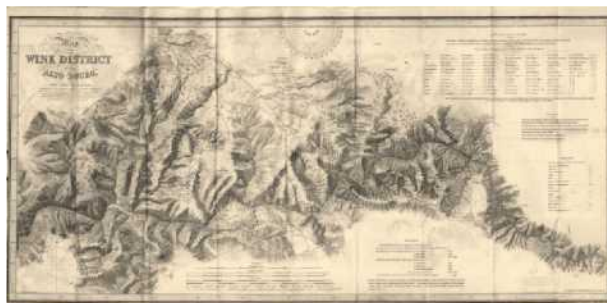
Mappa do Paiz Vinhateiro do Alto Douro [Map of the Wine Producing Country of the Upper Douro], Baron of Forrester, 1843

Quinta dos Frades features in the most important maps of the time, such as the Mappa das Terras vezinhas ao rio Douro [Map of Land Bordering on the River Douro] dated 1756 produced by the Companhia Geral das Vinhas do Alto Douro; the Mapa de Configuração do rio Douro [Map of Configuration of the River Douro] dated 1790 by Jacinto José de Sousa included in a manuscript in the Biblioteca Nacional, where it is named Quinta dos Frades de Salzedas; the Mappa do Paiz Vinhateiro do Alto Douro [Map of the Wine Producing Country of the Upper Douro] dated 1843; and the Mappa do Troço do Douro [Map of the Douro Stretch] dated 1848 where it is named Quinta dos Frades de São Bernardo, both created by the Baron of Forrester. Later, in 1894, the Viscount of Villa Mayor also refers to Quinta da Folgosa in his work " O Douro Ilustrado " [The Douro Illustrated].