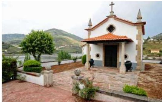
Chapel of Saint Bernardo, Quinta dos Frades