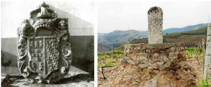
Coat of Arms of the Autonomous Congregation of the Cistercians of Saint Bernardo of Alcobaca and the Pombaline Landmark, Quinta dos Frades

The oldest references on this estate, at that time still named Quinta da Folgosa, date back to the twelfth century with the beginning of its constitution through various purchases and donations of plots of land. In this period, portions of land intended for the planting of vineyards are already mentioned. Decorative elements confirming the link between Quinta da Folgosa and Salzedas Monastery are still visible today, portrayed through the existing coat of arms of the Cistercian Order on the estate.